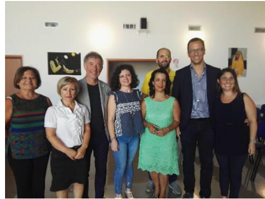
Participants in the Open Day of Badia Grande