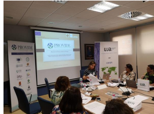
Another moment of the meeting

Soon, the first differences began to be seen both in terms of legislation (even in different regions within the same country) and in the way of understanding "gender violence" or "proximity violence" in different countries.