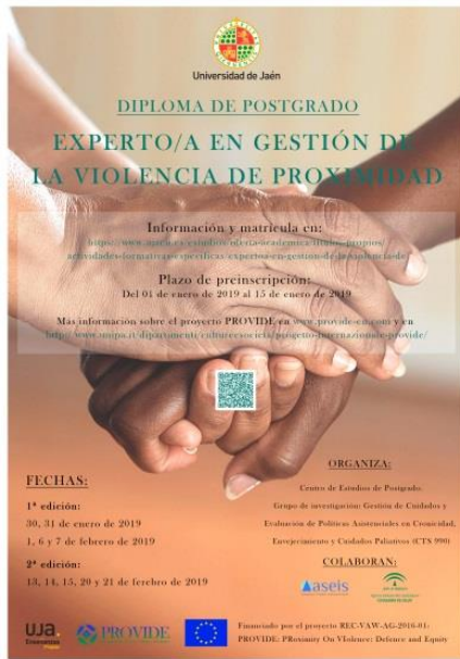
Poster for dissemination of the course in Jaen

and updates on immigration policies, legislation and the asylum support systems.