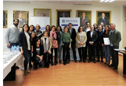
Assistants to the InfoDay in Jaen

“Expert in Proximity on Violence Management” which is going to be imparted on January and February.