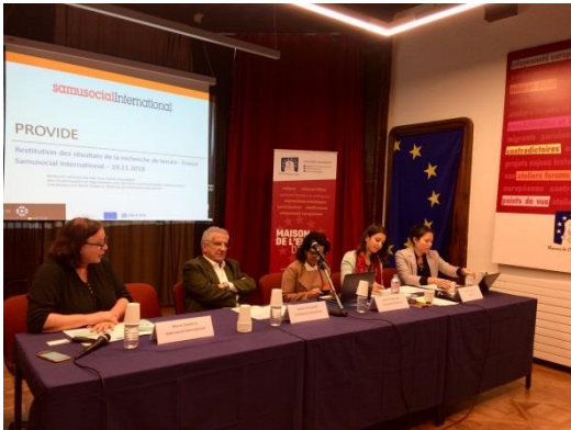
Conference table in Paris

presentation of the training phase that will be implemented during 2019 first six months concluded the conference.