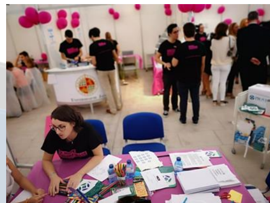
PROVIDE stand at the Researchers European Night

Additionally, the Jaen group decided on several meetings that they could not leave the opportunity to show the project on the well-known Researchers European Night when doing the InfoDay.