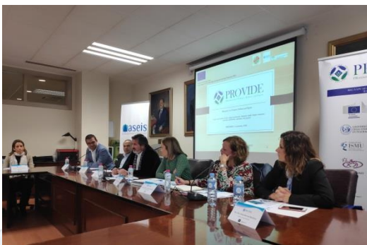
InfoDay at the University of Jaen

Likewise, an InfoDay was also held in Jaen (Spain) organized by the Association for Employment and Social Integration - ASEIS with the collaboration of the University of Jaen and the Alto Guadalquivir Health Agency.