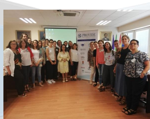
Assistants to the meeting

These conclusions highlight the suitability of the training courses that have already begun to take place as part of the next phase of the PROVIDE project.