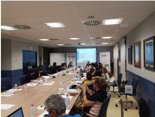
Panoramic of the meeting at the University of Jaen