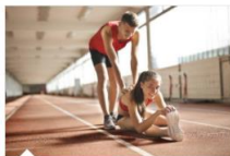
University Sport Center