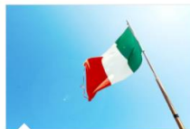
University Language Services