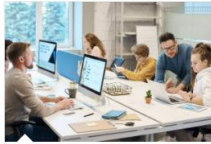
Help desk for international students - Guidance and Tutoring Center (COT)

Unipa provides its foreign students a lot of Facilities & Services such as Help Desk, Accommodation and Canteen, and also with free medical consultation through the University Medical Clinic (AMU) and psychological counselling through the Guidance and Tutoring Center (COT).