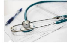
Unipa Medical Clinic