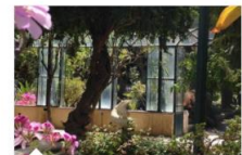
UNIPA Museums and Collections